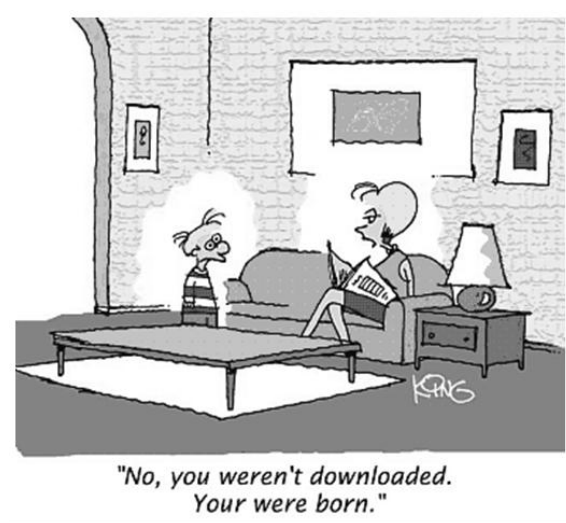
Figure 1. A typical figure

Figure and table captions should be centered if less than one line (Figure 1), otherwise justified and indented by 0.8cm on both margins, as shown in Figure 2. The caption font must be Helvetica, 10 point, boldface, with 6 points of space before and after each caption.